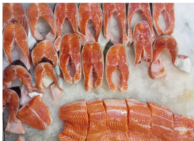
Figure 2 Fillet of Turkish salmon

where CDI stands for chronic daily consumption of a carcinogen in mg/kg of body weight per day, and refers the lifetime mean diurnal dose of exposure to the carcinogen. The cancer risk connected with the exposure