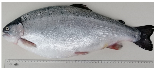
Figure 1 Turkish salmon

Analytical procedures. The trace elements in the Turkish salmon fillets were determined by